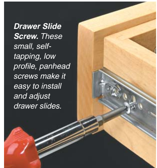
Drawer Slide Screw. These small, self-tapping, low profile, panhead screws make it easy to install and adjust drawer slides.

Working with MDF or melamine presents a real challenge when it comes to screws. Here, the Confirmat screw works great whenever edge-to-face joining is needed for MDF or melamine workpieces. The deep threads, oversized shank, and a head that is just a bit larger than the