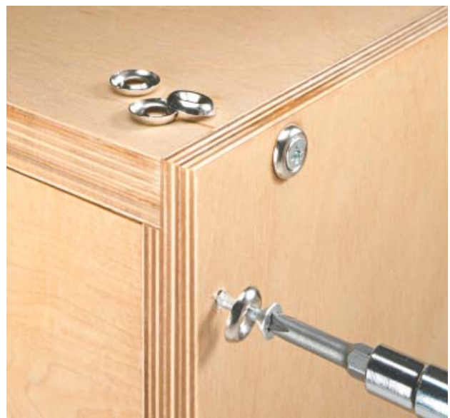
▲ Trim Washer. Trim washers are a great way to strengthen an assembly, especially near the edge where you may not want to countersink the screw.

And finally, trim washers can prevent "overdriving" the screw. Which can be a problem in softer materials.